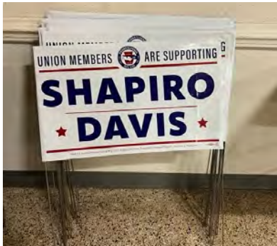
Shapiro - Davis yard signs in IBEW Local 712 Edmund D. Hill Complex.