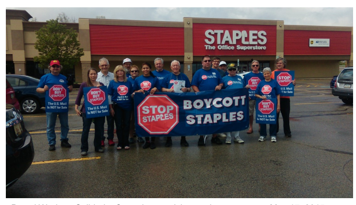
Postal Workers Solidarity Committee activists and supporters at May 17, 2015, "Stop Staples" rally at the Monaca Staples store.

because the Postal Service does, after all, provide universal service to all; and they need the Postal Service.