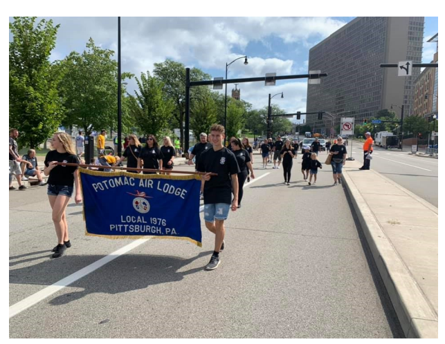
Part of the UE Contingent who marched in the NWPA ALF Labor Day parade in Erie. More than 300 UE Local 506 members marched in the parade. For the third year in a row, UE Local 506 won 1<sup>st</sup> place for the most participants in the parade.