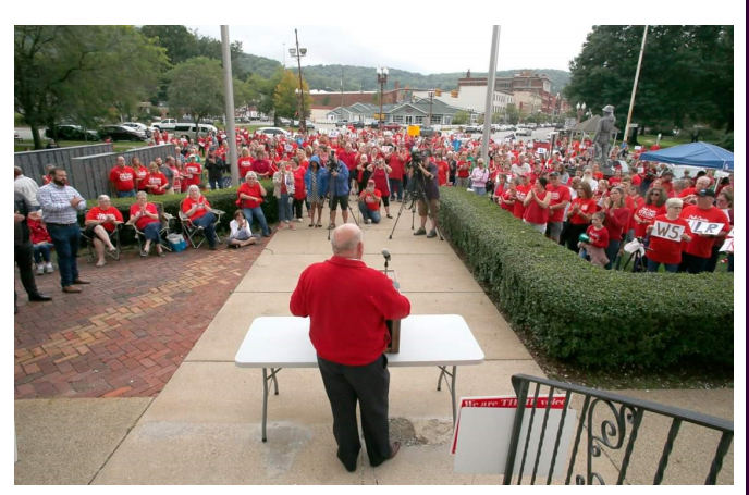
Labor Day rally at the Venango County Courthouse expressing opposition of community members, elected officials, Polk State Center employees and families of Polk residents to Pa. Dept. of Human Services plan to close Polk State Center for individuals with intellectual and developmental disabilities. The rally-goers heard testimony from the families of Polk State Center residents who fear that residents will not receive the same level of care if residences are place into "community" settings. AFSCME Local 1050 represents 626 Polk State Center employees.