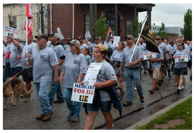
IAM Local 1976 contingent marching in the Allegheny-Fayette Central Labor Council Labor Day parade in Pittsburgh. For the past 37 years the Labor Council has put on the largest participation Labor Day parade in the United States.