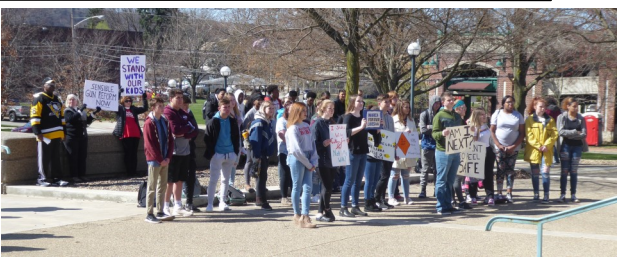
Beaver Area High School students rallying in front of Beaver County Courthouse in support of stricter gun control laws.