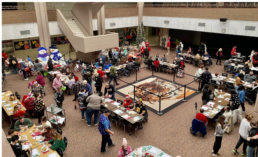
Beaver Falls Free Christmas Dinner. The Labor Council donated $500 to the Beaver Falls Christian Assembly Care Outreach Ministry to help defray the cost of the dinner. Several Labor Council Executive Board members served at workers at the dinner. At the bottom of the page insert the Dr. King article.

* The 2025 Labor Council calendars are still available for distribution. Please attend the January Labor Council meeting or contact me if you would like to receive a calendar.